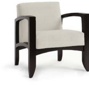
Sodo - Wood