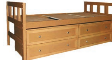
Bed & Storage System