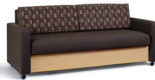
Morpheus Sleep Sofa: with and without storage drawers