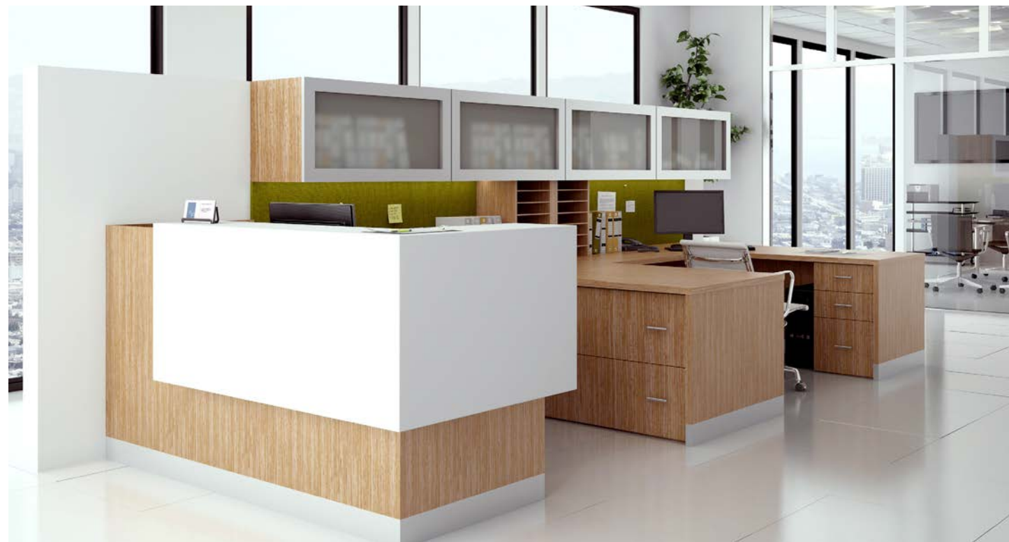
From Top: Custom Reception Station for Evergreen Health; Oly Reception Station