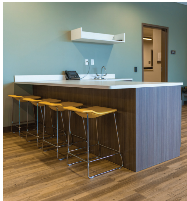
Clockwise From Top: Morpheus Sleep Sofa; Breakroom Cabinets with Solid Surface Top and Integrated Sink; Floating Cabinet with Solid Surface Top and Integrated Sink