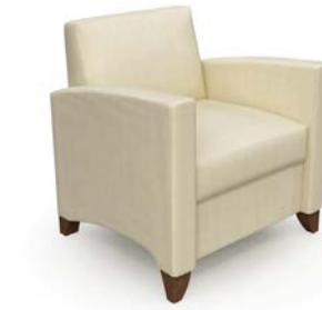
Sodo - Lounge