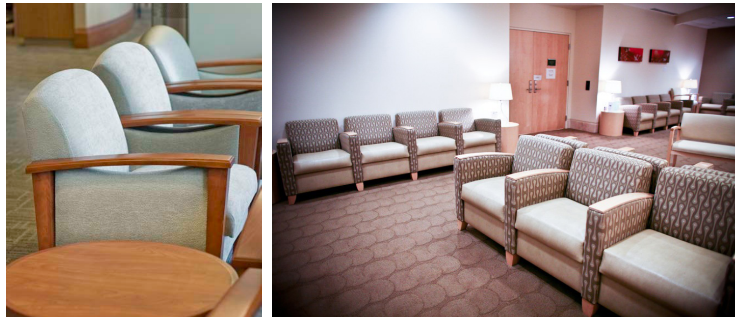
Clockwise From Top: Albany Lounge Chair & Sofa; Sodo Lounge Chair with Arm Caps; Mercer Lounge Chairs