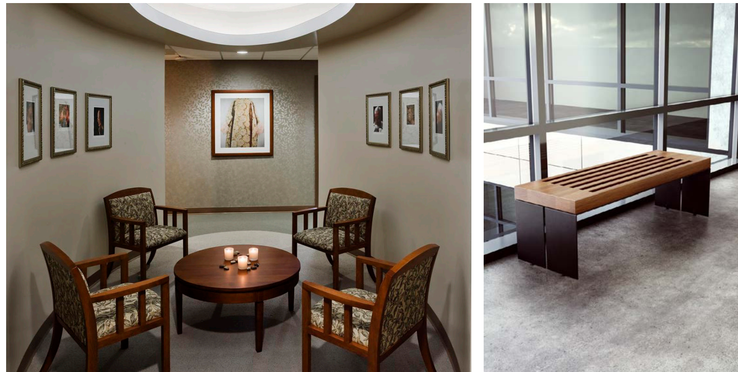
Clockwise From Top: Kenzie Ottoman; Jaydee Bench; Camano Chairs & Medina Round Occasional Table