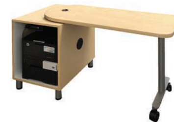
Pivoting Doctor's Desk, Mobile Storage Cart with Scribe Board