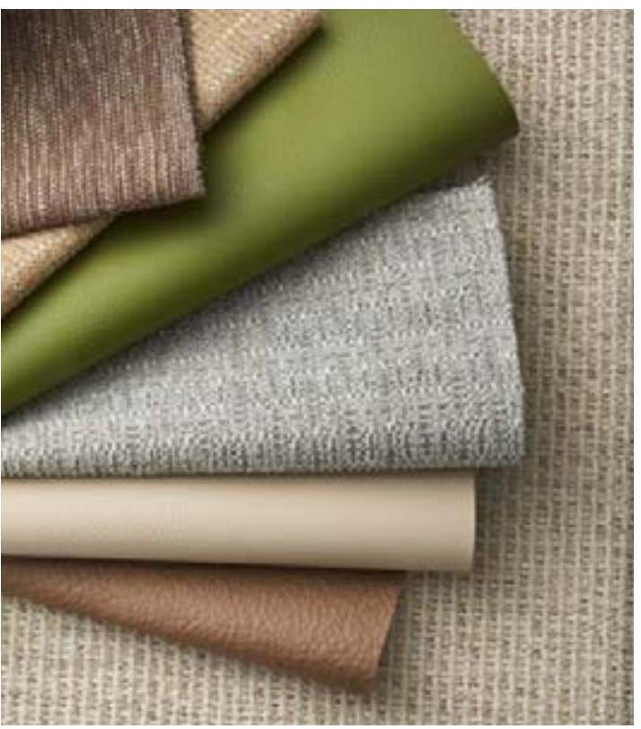
2021 Fabric Grades