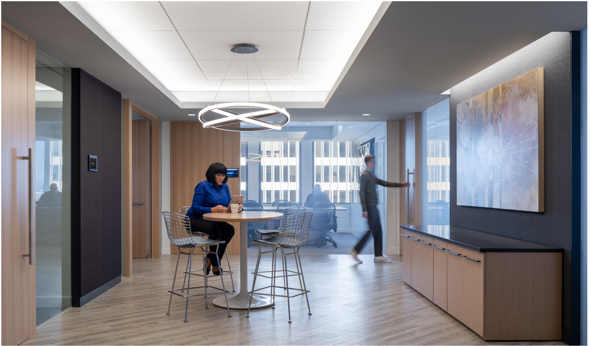
Bar height Tulip Cafe Table with Rift Cut White Oak Veneer top and Designer White Solid Surface base + custom Albany LRC credenza in Rift Cut White Oak Veneer with Quartz top