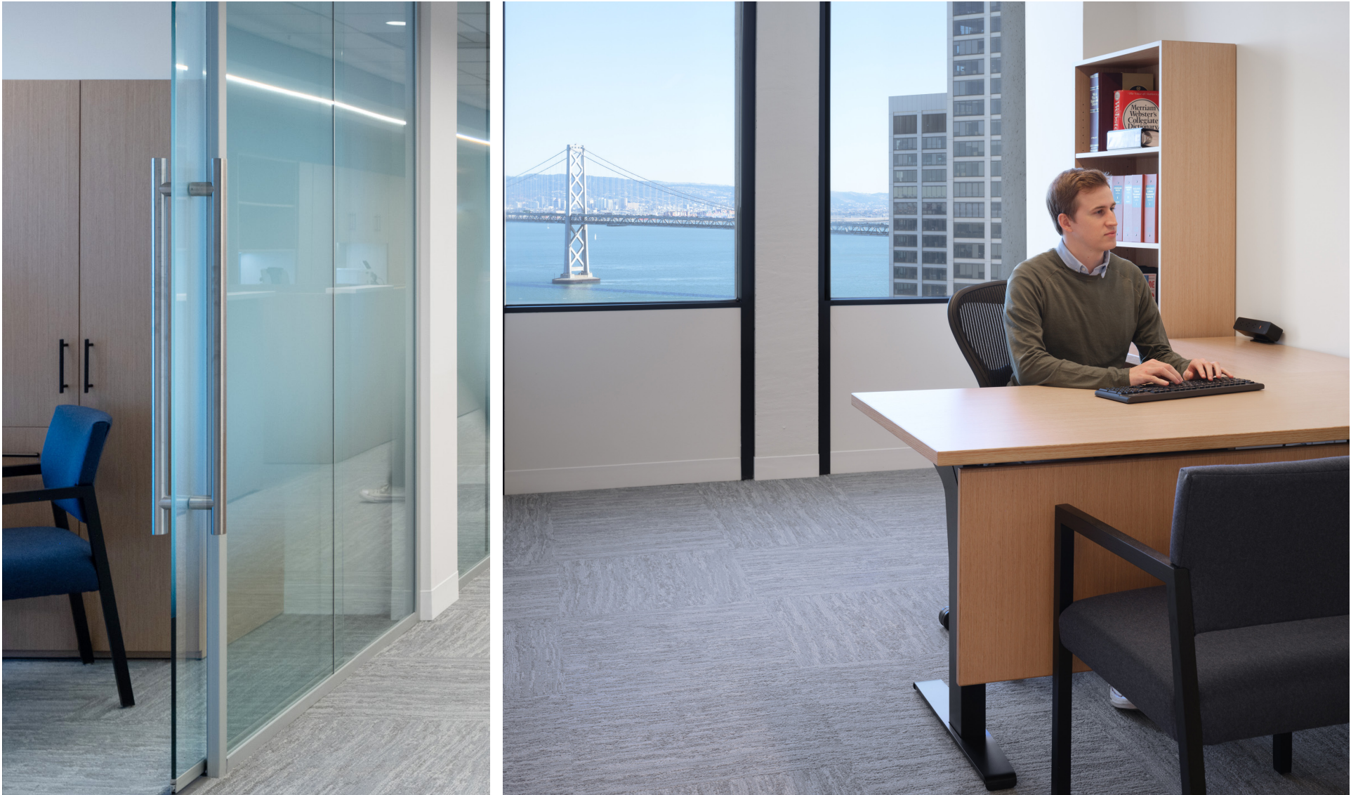
From Left: Kenzie Side Chairs in Black Oak + Rift Cut White Oak Veneer; Custom Wardrobe Custom Rift Cut White Oak Veneer Height Adjustable Desks and Returns with Modesty Panels + 5 Shelf Bookshelves